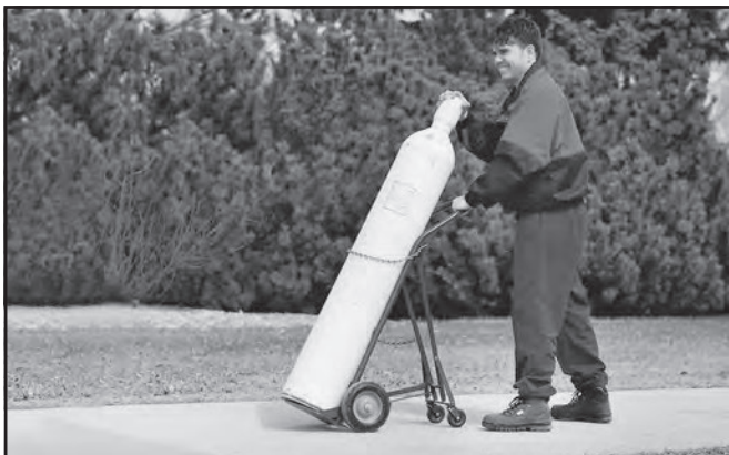
Compressed oxygen cylinder home delivery

Oxygen is squeezed into a tank at high pressure. The company delivers tanks to your home.