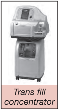
Trans fill concentrator