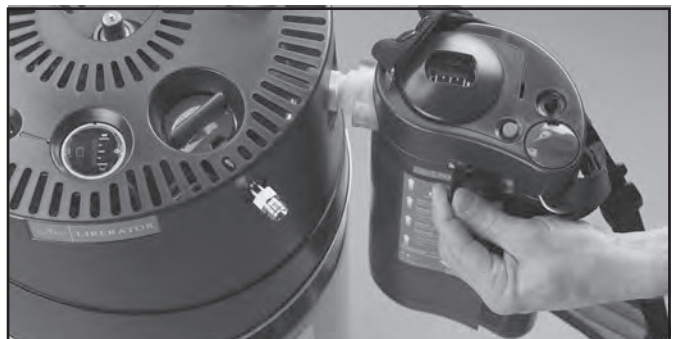
Liquid Oxygen: Home System